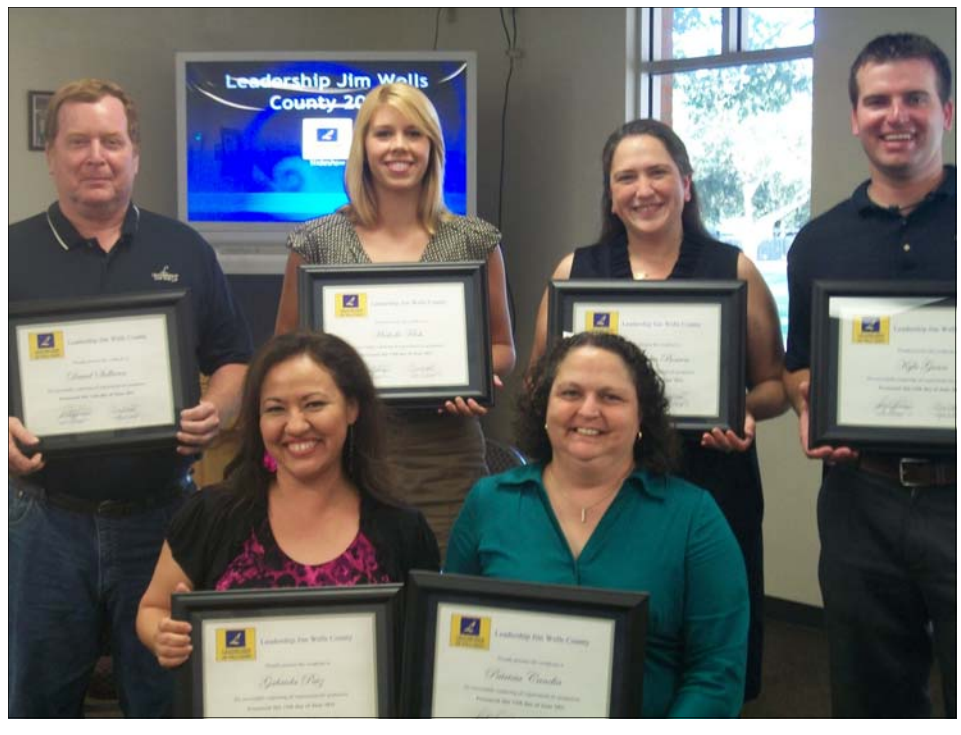
The Class of 2011 wrapped up the year in June and will serve as the 2011-12 facilitators for the next session.

The Leadership curriculum includes sessions in local government that gives the group a prospective of local government and issues about the area. Ethics and communications enhance roles and ideas about the world through ethical