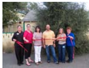
Everything Elko Magazine