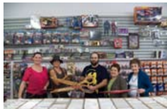
Frank 'N' Freds