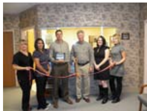
Ruby Valley Ear, Nose, Throat, & Allergy