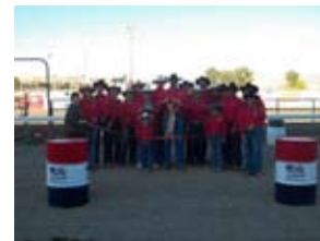
V-L Rodeo Productions