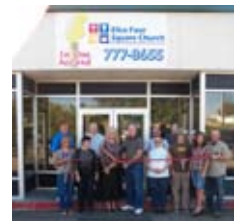
Elko Four Square Church