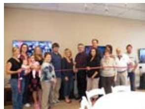
Encore Audio & Visual Design