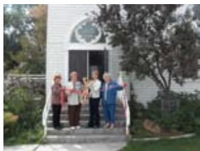
Lamoille Community Presbyterian Church