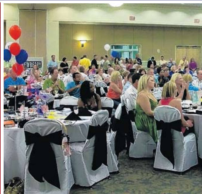
PIG ROAST CROWD 2009