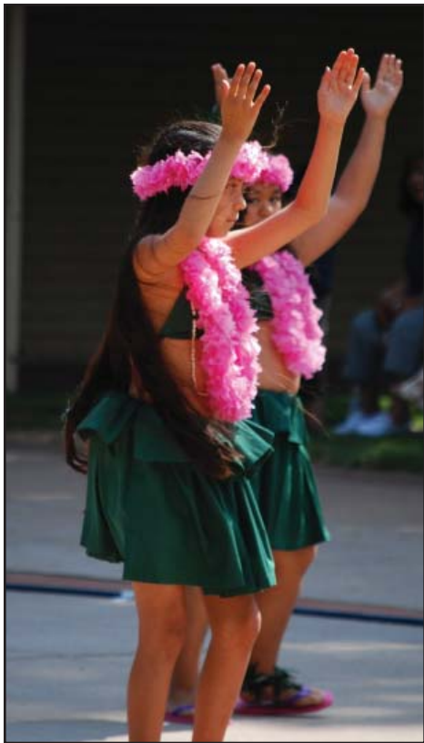
Polynesian dancers provided entertainment for the crowd.