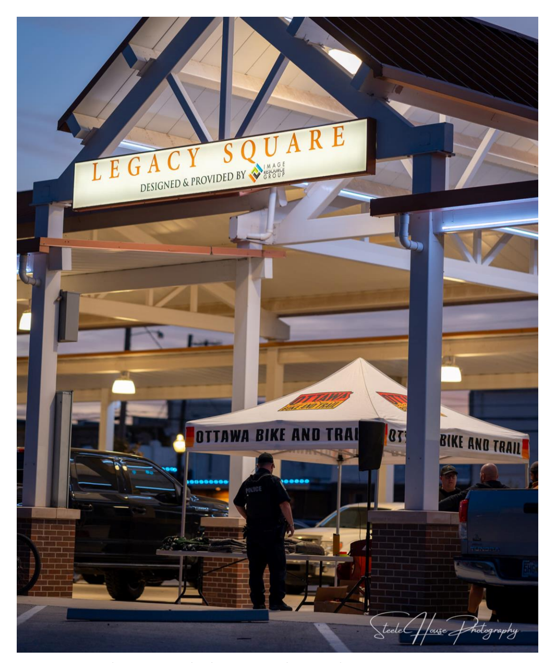
Early start with the 100-mile race beginning at 7am