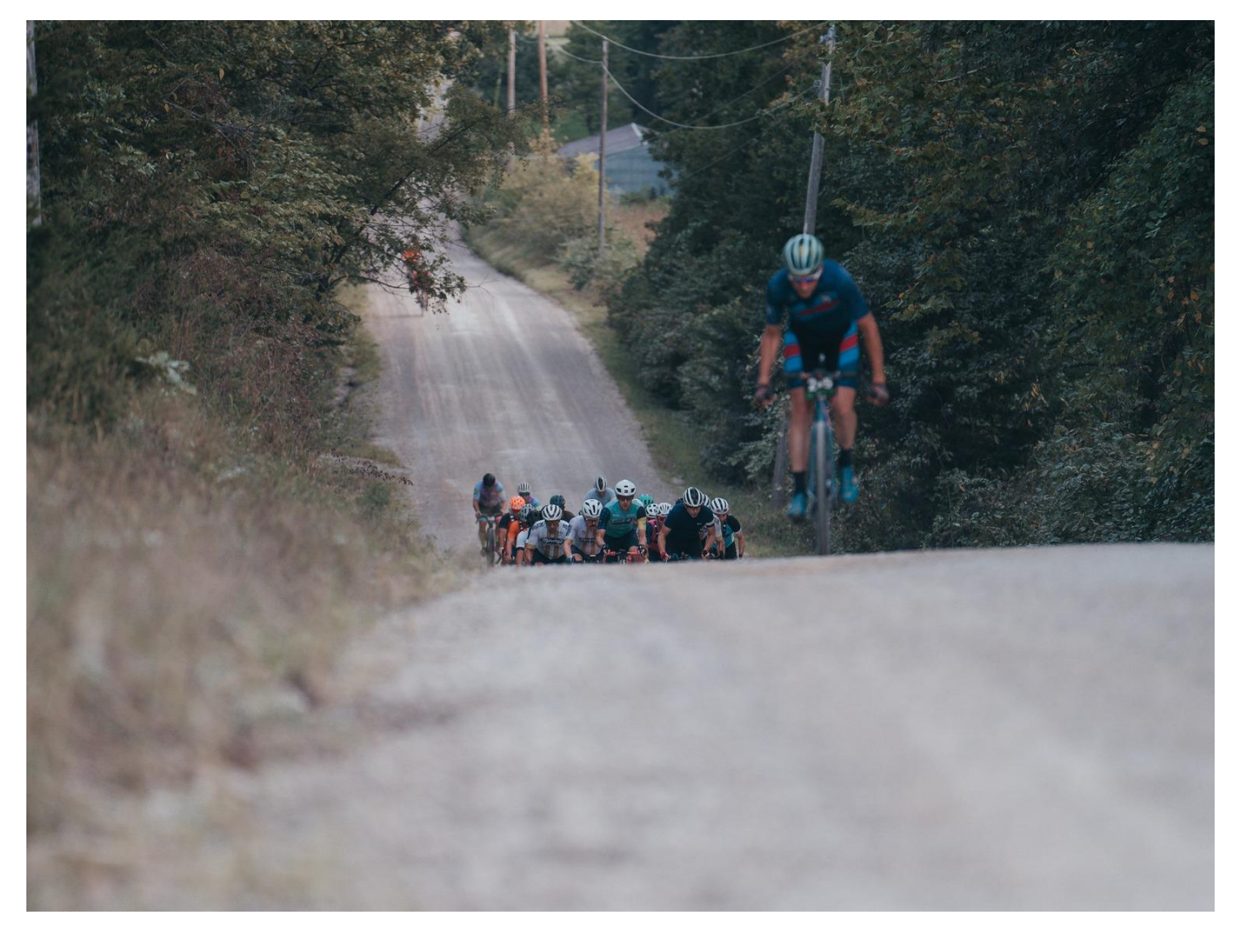
Some of those hills I was referring to