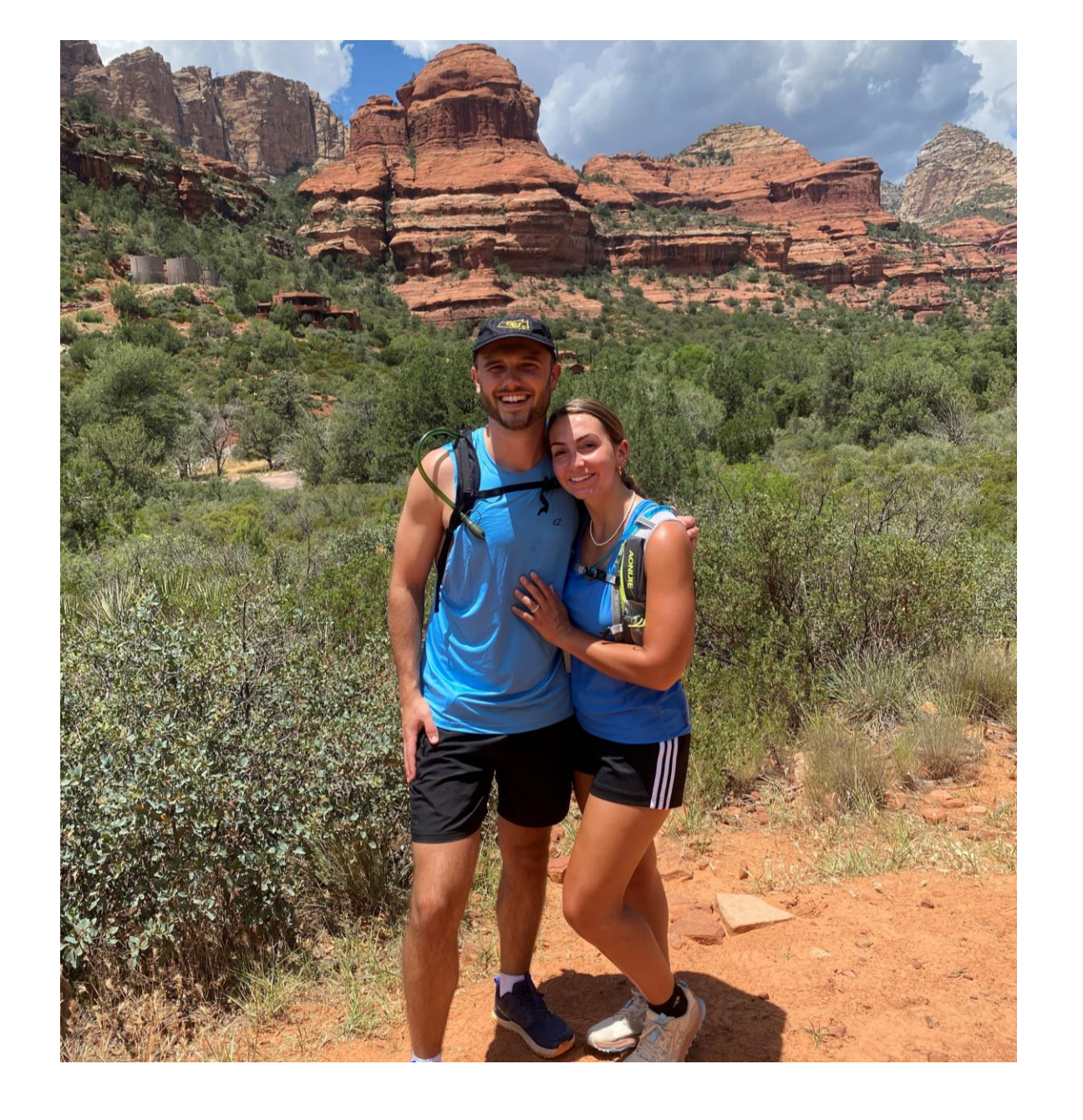
Matching for our hike