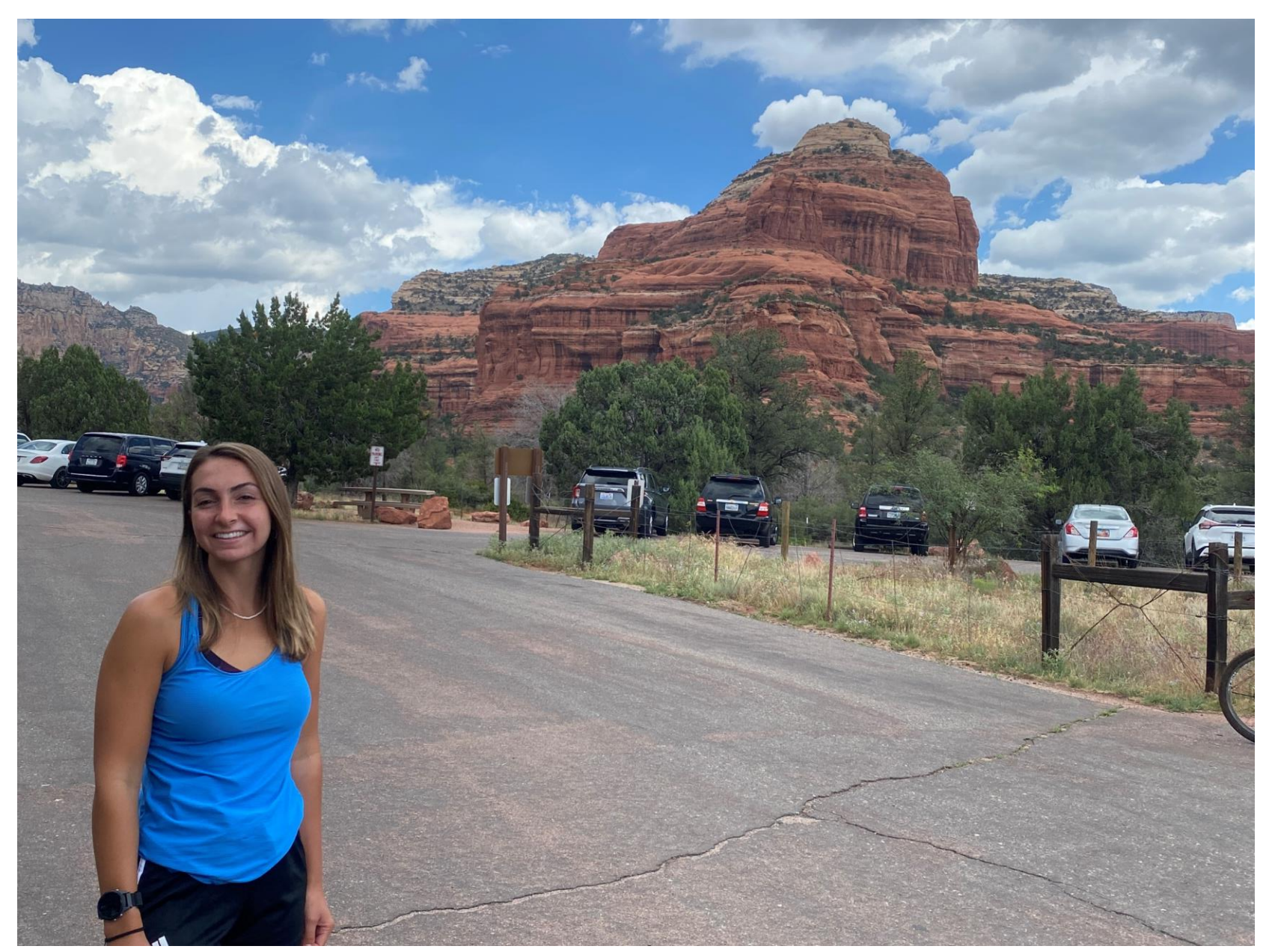
Made it to Sedona