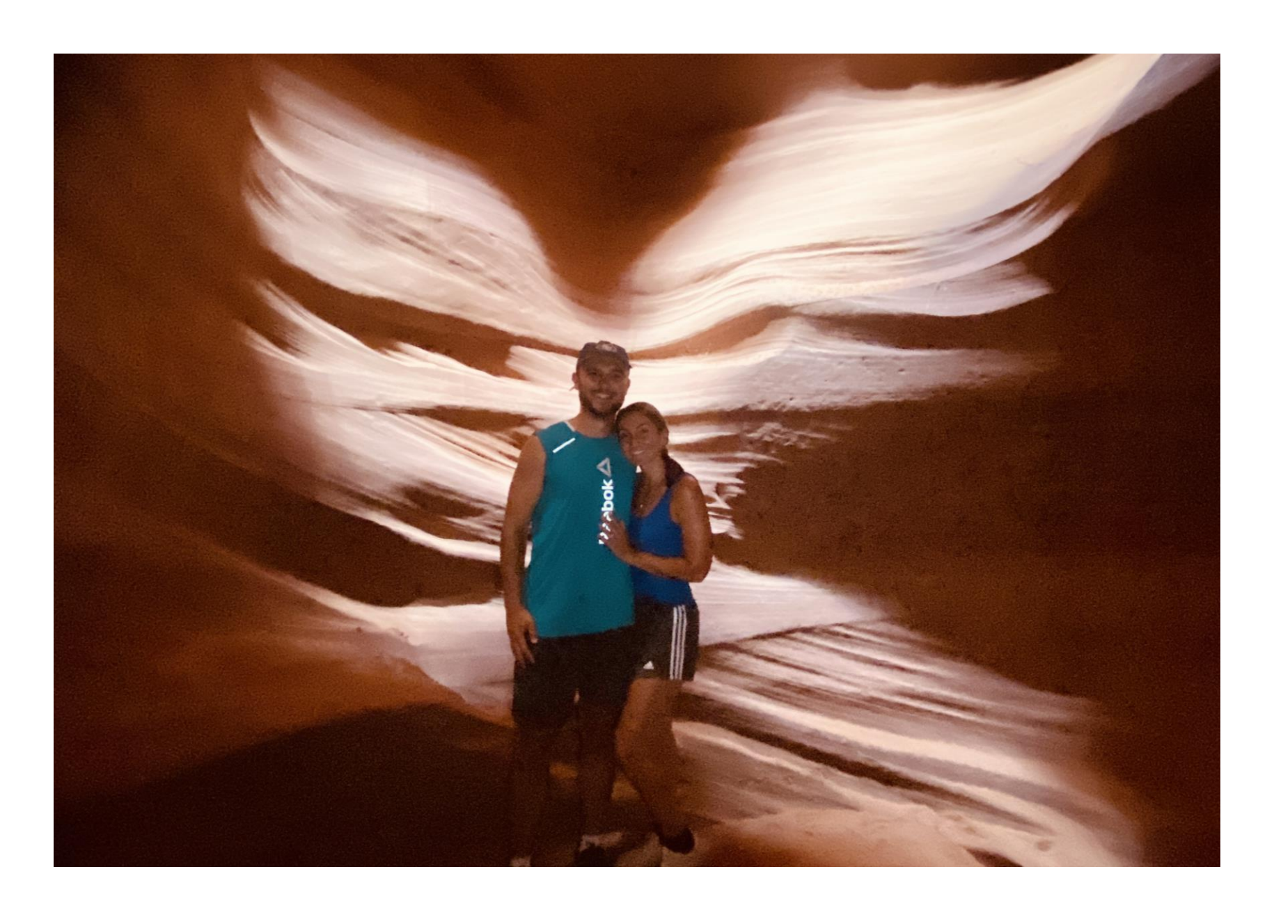
The light shining through resembles butterfly wings