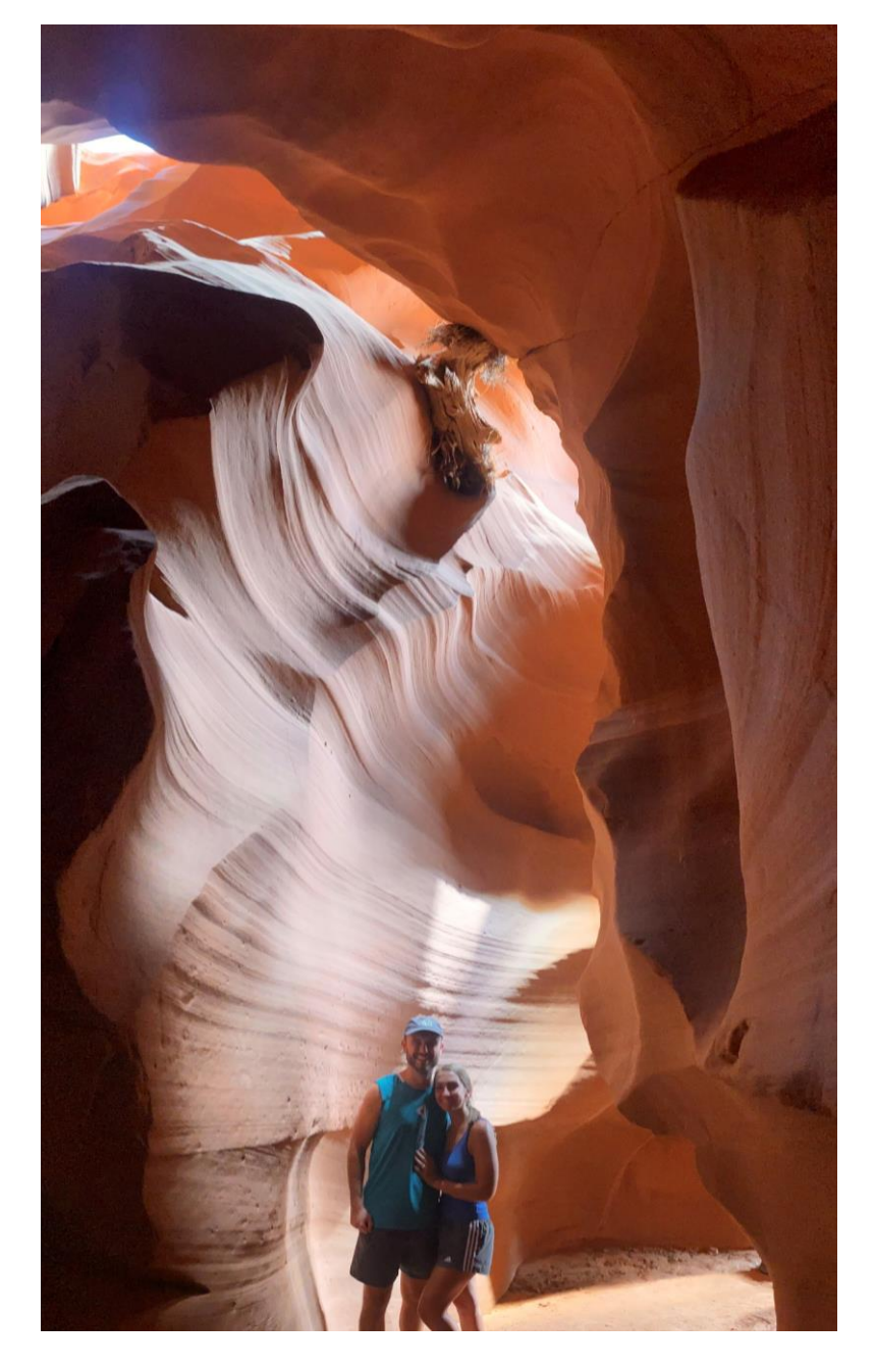
Beautiful slot canyon tour