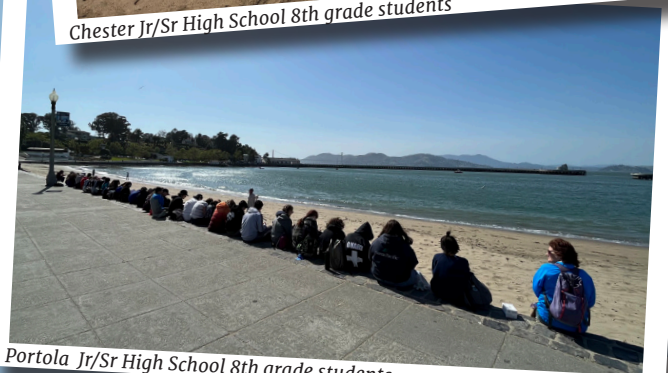
Portola Jr/Sr High School 8th grade students