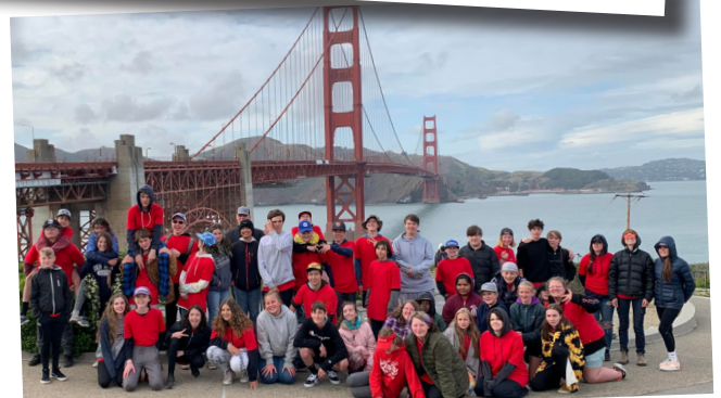
Quincy Jr/Sr High School 8th grade students