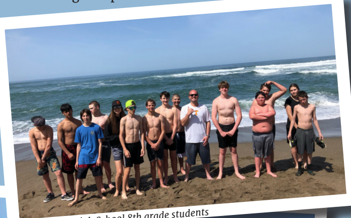
Chester Jr/Sr High School 8th grade students