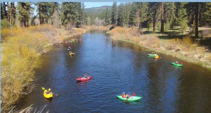
C. Roy Carmichael Elementary 6th graders float on the river in kayaks.

So it was especially gratifying this month to see 6th graders get out on the river. Whether in kayaks or rafts, the students took to the water with excitement and big smiles on their faces.