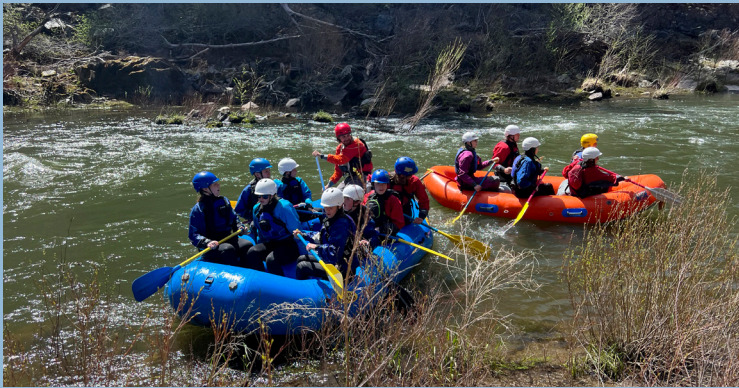
Quincy Elementary 6th graders raft the Feather River with the help of FRC students

The Plumas County Office of Education and Plumas Unified School District Newsletter