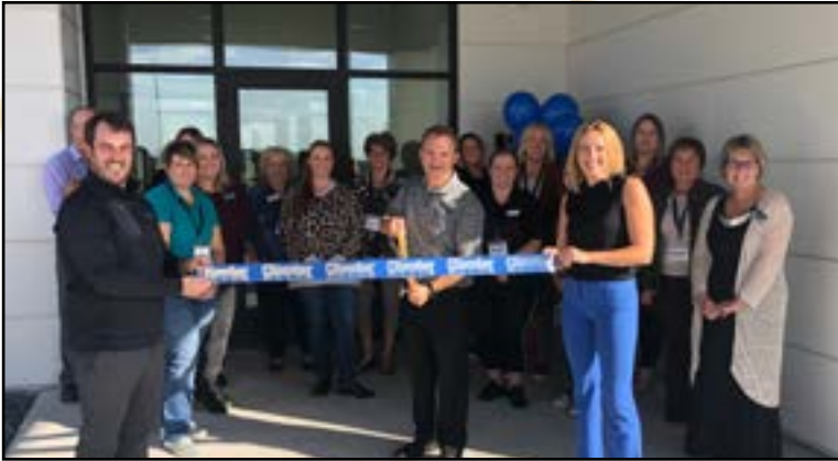
Core Property - SoCo