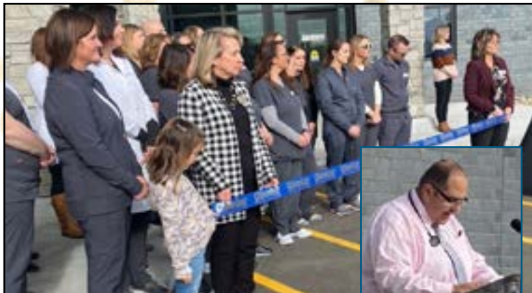
Grand Forks Clinic