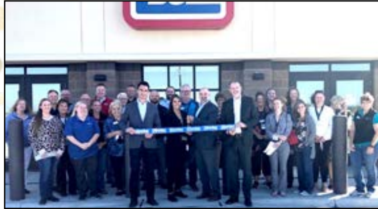
Border States Electric