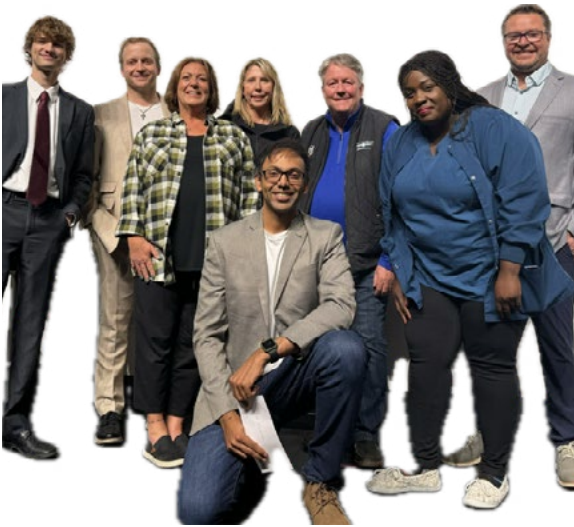
Pictured are Shark Tank Winners, Sharks and the emcee.

We are happy to say no one suffered a Shark bite at the Chamber Shark Tank event! 9 brave entrepreneurs jumped into the tank to present their business idea.