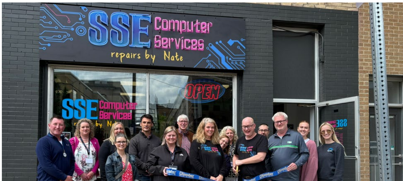
Pictured are employees of SSE Computers their guests and Chamber Ambassadors

2100 S Columbia Rd #114, Grand Forks, ND