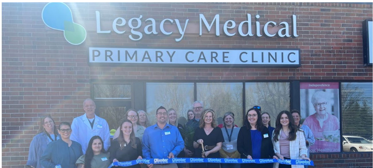
Pictured are employees of Legacy Medical their guests and Chamber Ambassadors