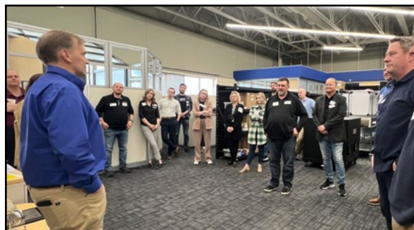
Tours and Talks group at Ideal Aerosmith.