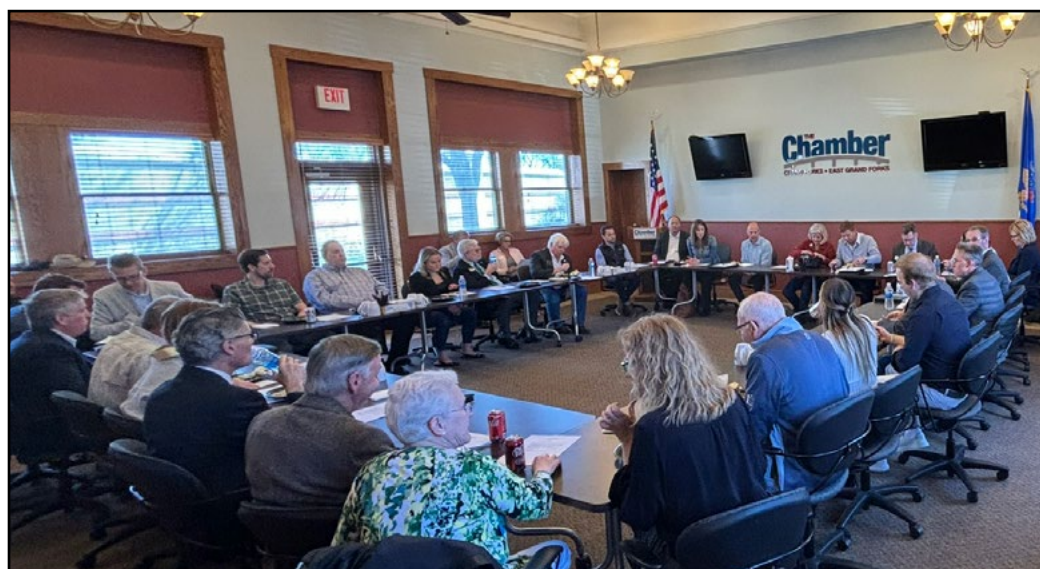
Pictured are current legislators and legislative candidates throughout Grand Forks County along with EDC, UND, City and County Leaders.

On the horizon for 2025 is funding for such things as city infrastructure and quality of life items like the discovery Center; UAS Funding at Grand Sky, base retention funding, workforce and business development funding and several others. Finally, for UND the big priorities at this point are: