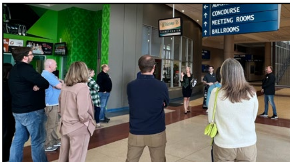
Tours and Talks group at The Alerus Center.