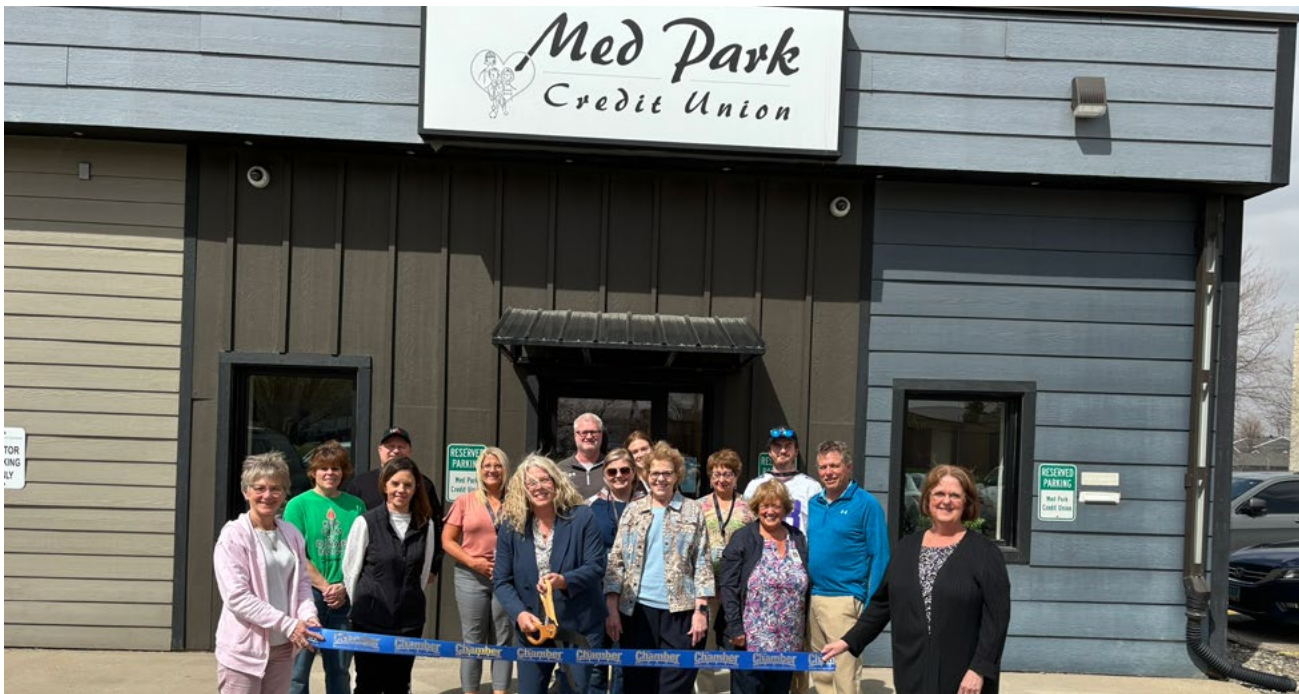
Pictured are employees of Med Park Credit Union and Chamber Ambassadors