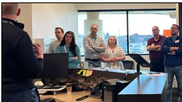
Tours and Talks group at Cirrus.