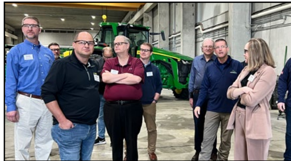
Tours and Talks group at True North Equipment.