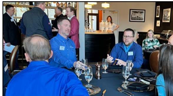
Tours and Talks group at The Landing located in The Olive Ann Hotel.