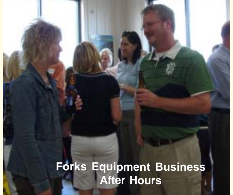
Forks Equipment Business After Hours