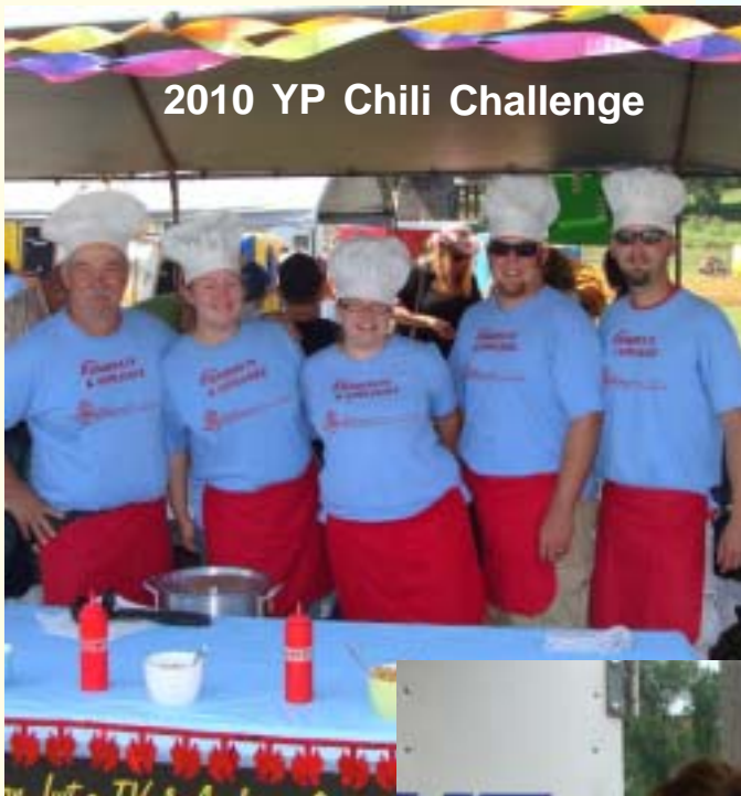
2010 YP Chili Challenge