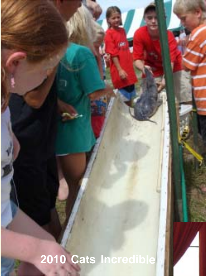
2010 Cats Incredible