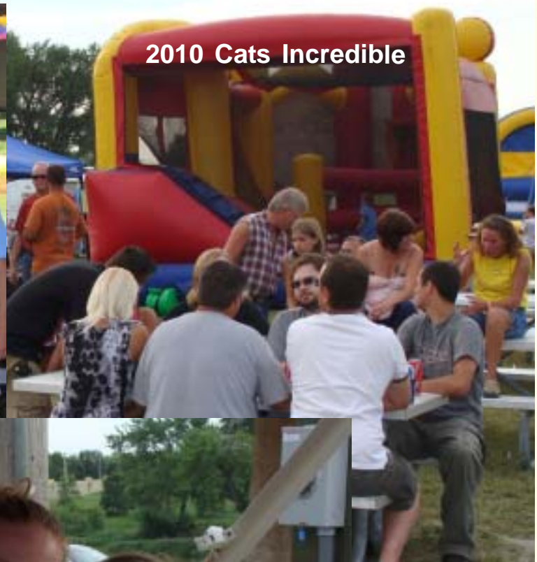
2010 Cats Incredible