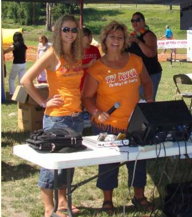
2010 YP Chili Challenge