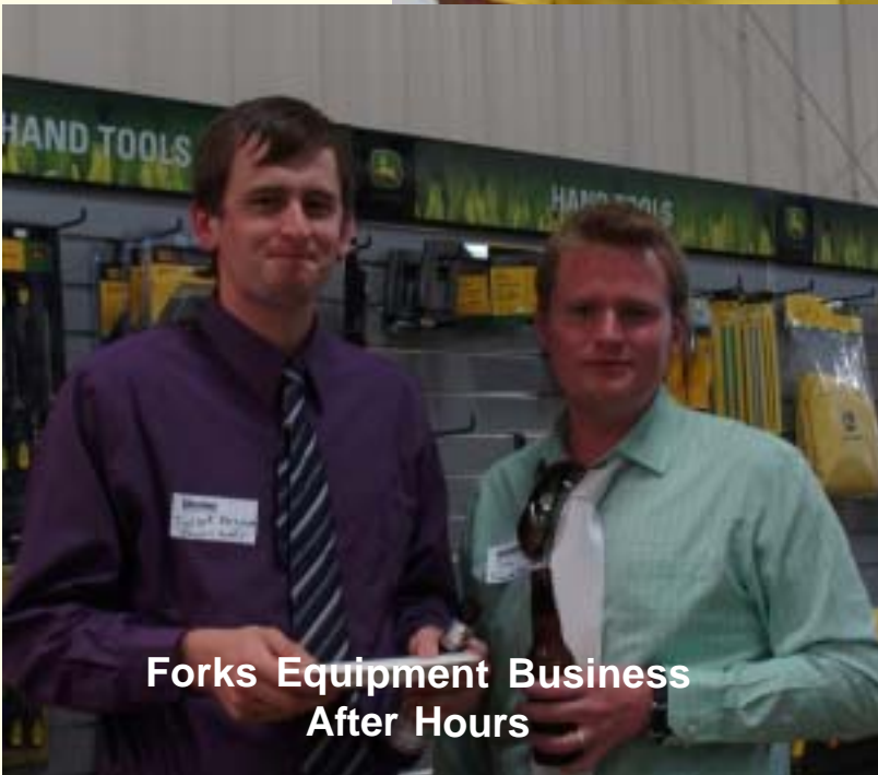
Forks Equipment Business After Hours