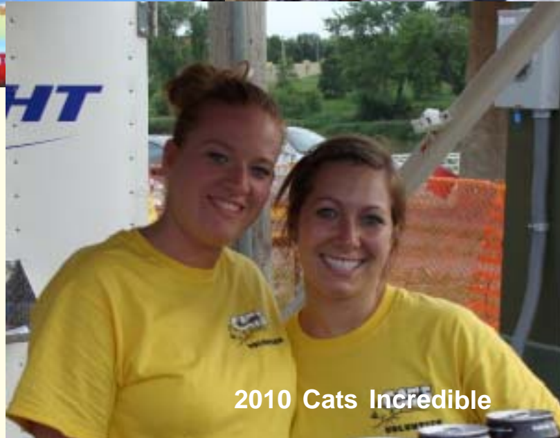
2010 Cats Incredible