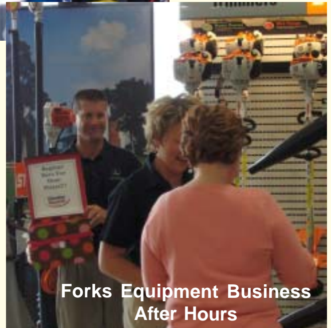
Forks Equipment Business After Hours