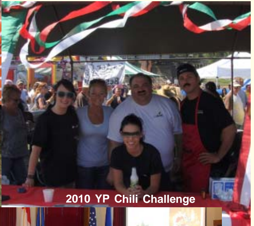
2010 YP Chili Challenge