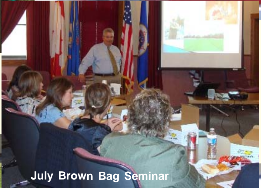
July Brown Bag Seminar