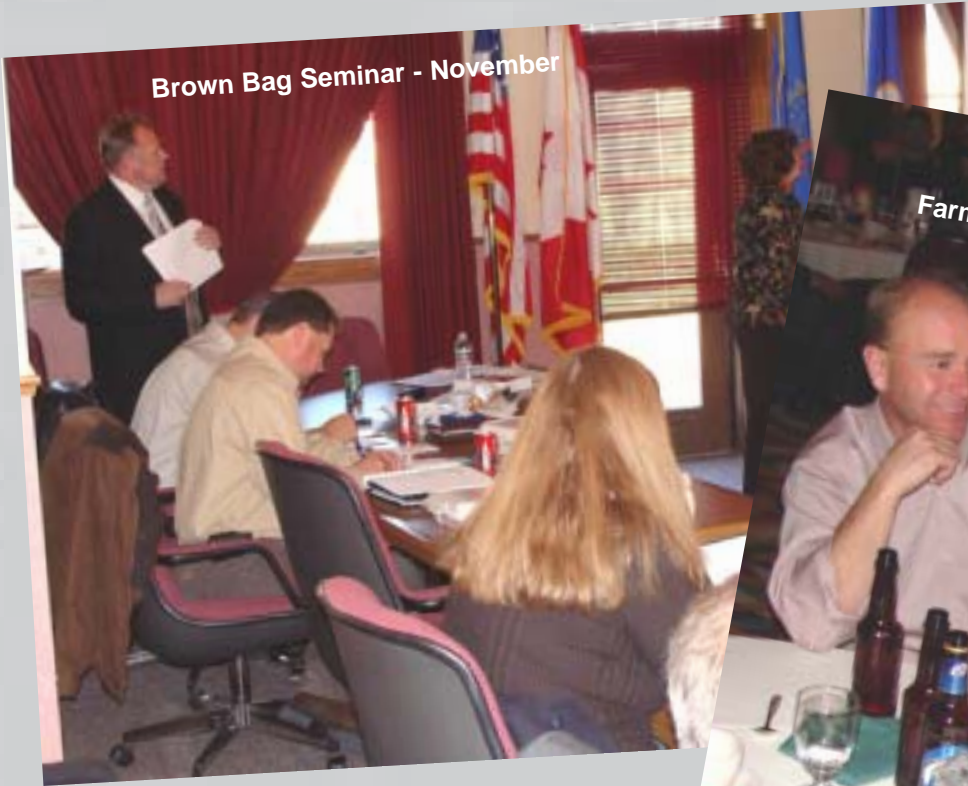
Brown Bag Seminar - November