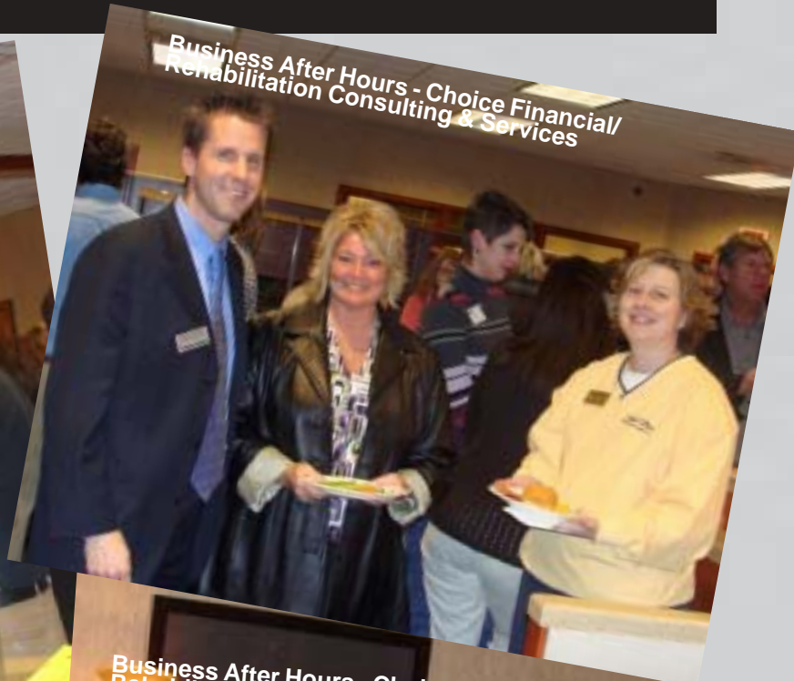
Business After Hours - Choice Financial/ Rehabilitation Consulting & Services