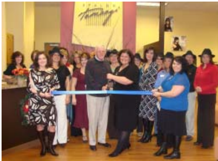
Laser Esthetics of ND & Heart Institute of ND The Ambassadors welcomed new Chamber member, Laser Esthetics of ND & The Heart Institute of ND, with a ribbon cutting.