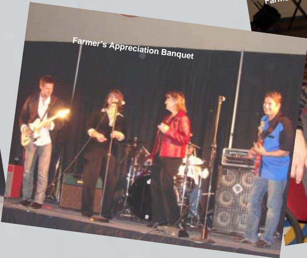
Farmer's Appreciation Banquet