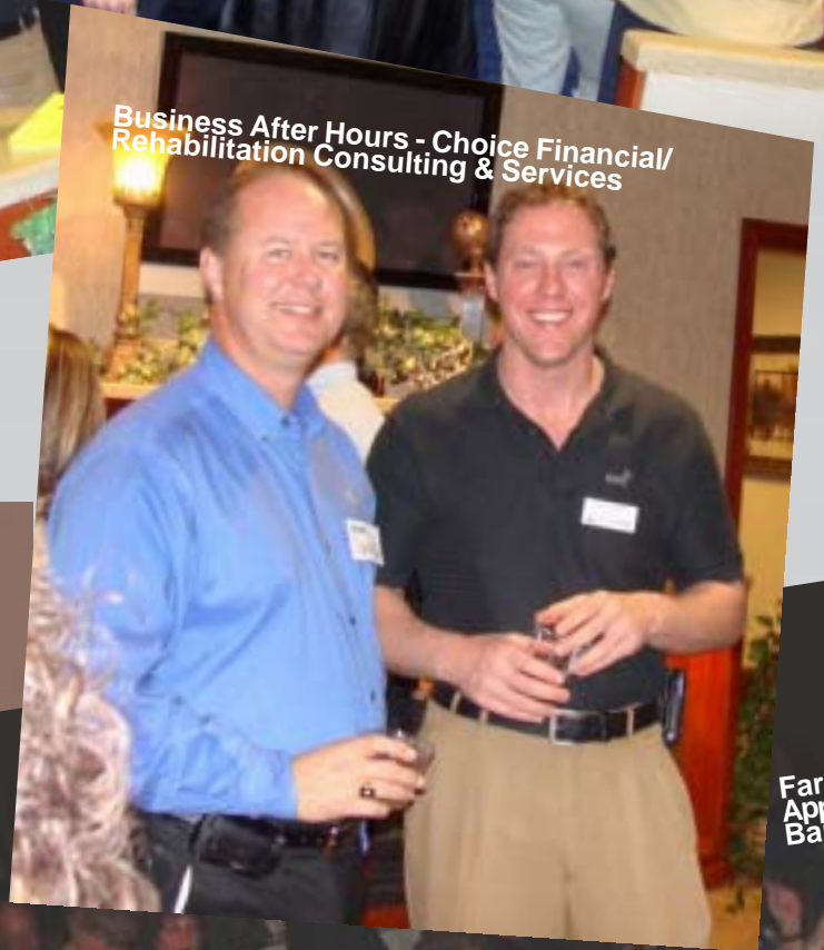
Business After Hours - Choice Financial/ Rehabilitation Consulting & Services