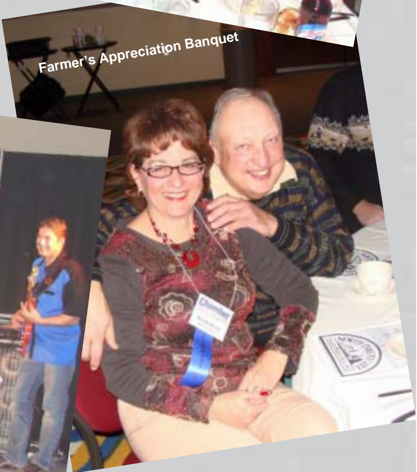
Farmer's Appreciation Banquet