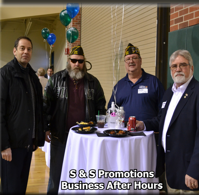
S & S Promotions Business After Hours