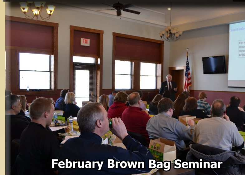
February Brown Bag Seminar