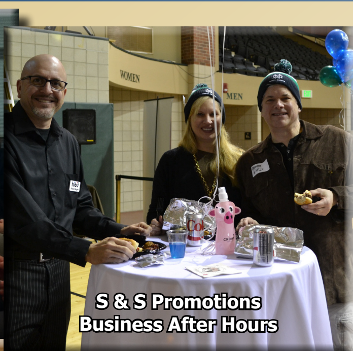
S & S Promotions Business After Hours