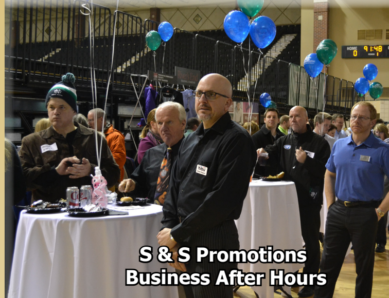
S & S Promotions Business After Hours