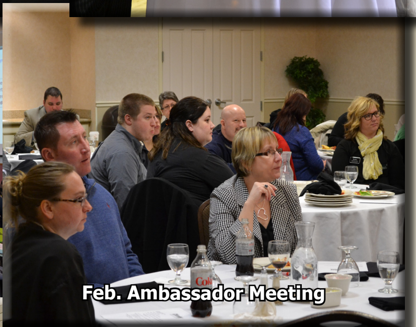
Feb. Ambassador Meeting