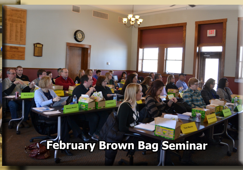
February Brown Bag Seminar