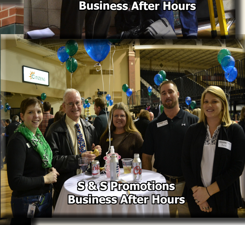
S & S Promotions Business After Hours