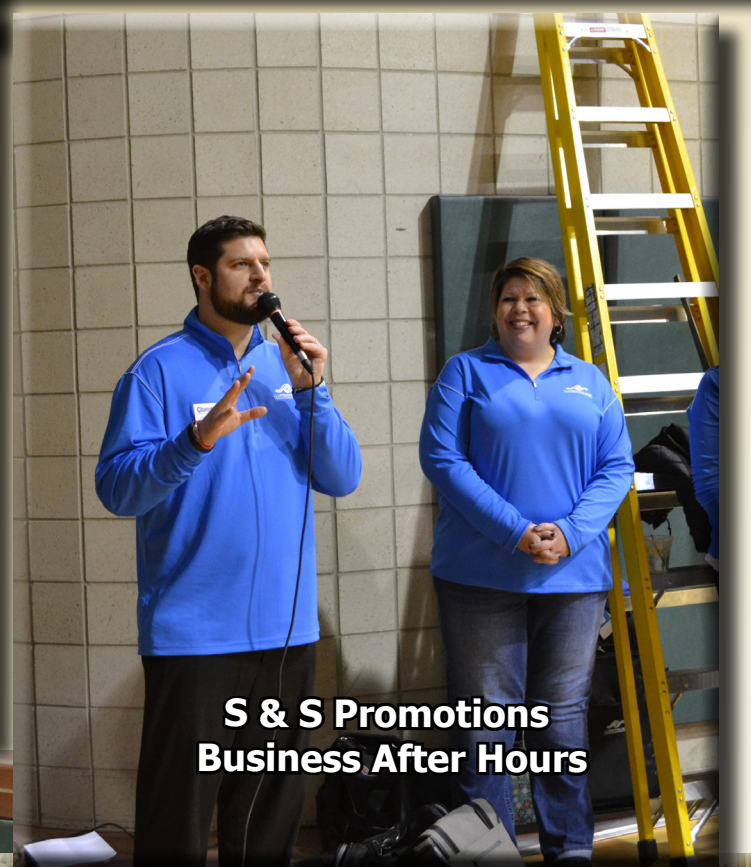
S & S Promotions Business After Hours