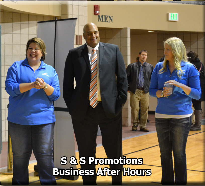
S & S Promotions Business After Hours