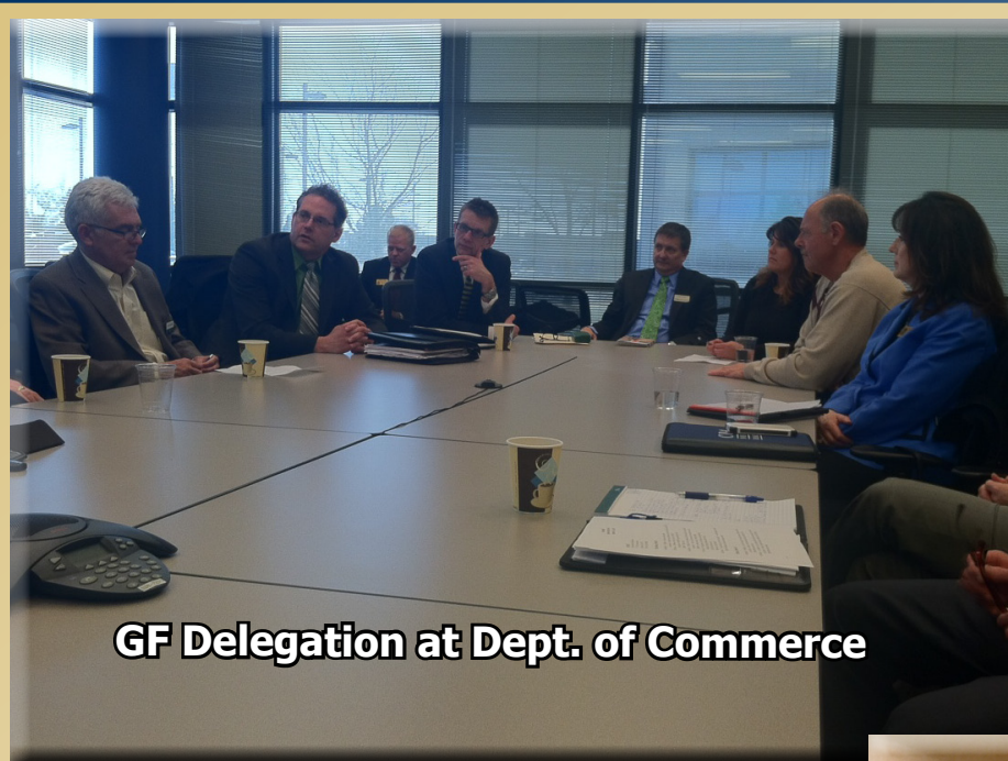
GF Delegation at Dept. of Commerce