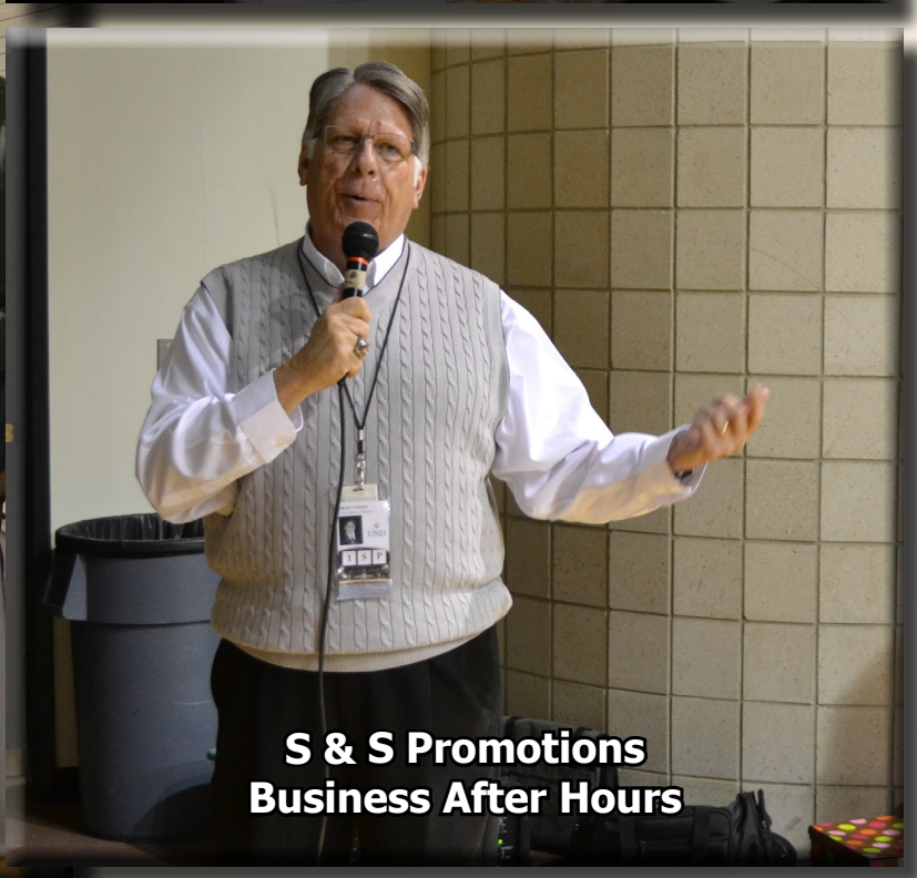
S & S Promotions Business After Hours