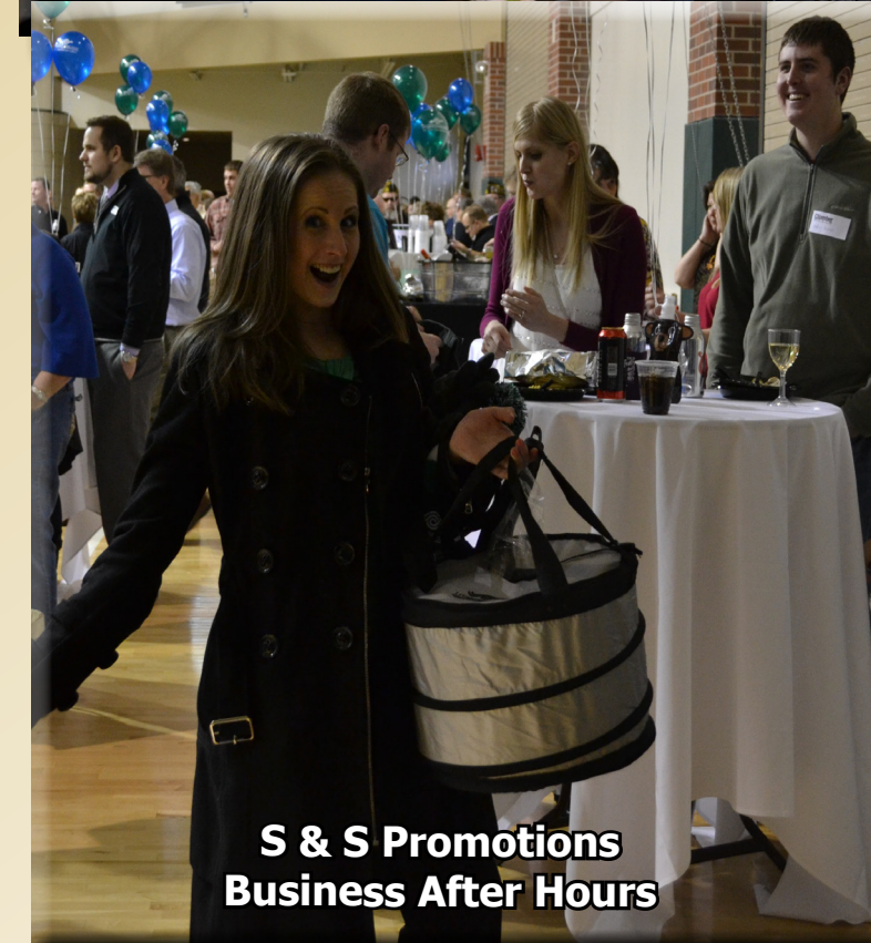
S & S Promotions Business After Hours