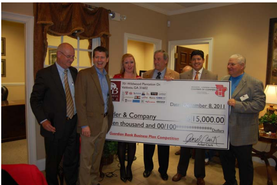
Fowler & Company wins 2011 Guardian Bank Business Plan Competition